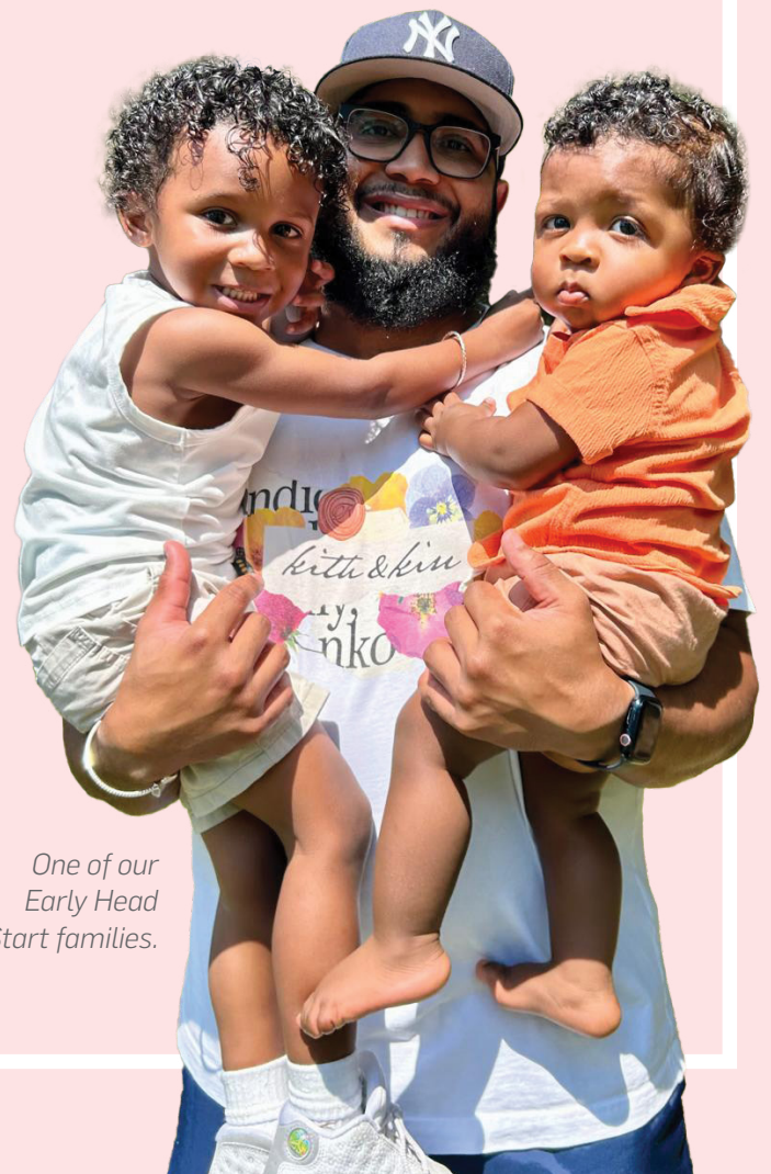
One of our Early Head Start families.

Across every family we partner with, whether navigating crisis, building new skills, or simply looking for a safe space close to home, Rising Ground's commitment is the same — show up, stay present, and believe in what families can do when they have what they need.