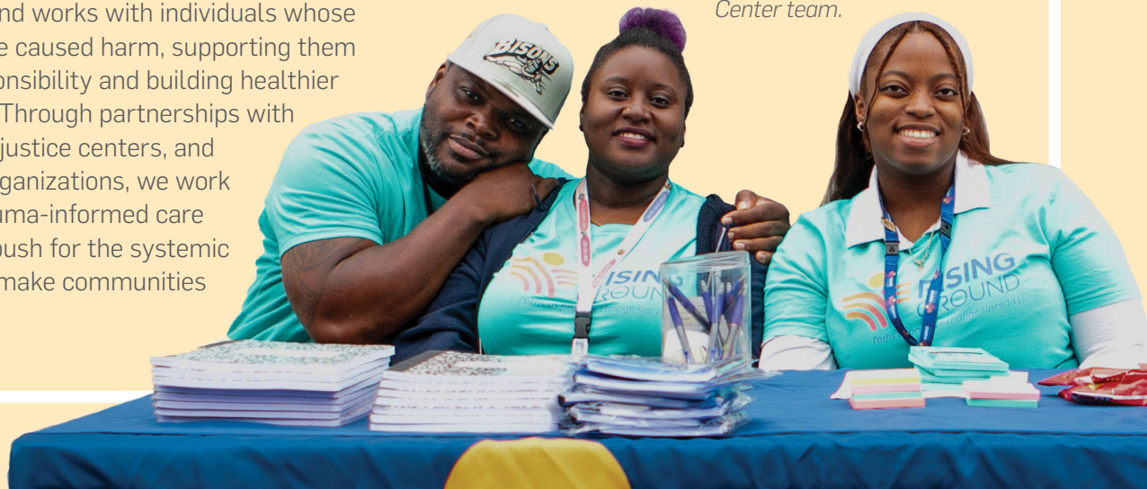
Members of the Trauma Recovery Center team.

Rising Ground also reaches survivors who have been criminalized and works with individuals whose behaviors have caused harm, supporting them in taking responsibility and building healthier relationships. Through partnerships with city agencies, justice centers, and community organizations, we work to expand trauma-informed care citywide and push for the systemic changes that make communities safer for all.