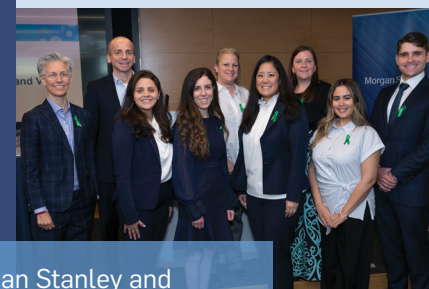
Morgan Stanley and Rising Ground staff on the Strategy Challenge team.

Rising Ground was selected to participate in Morgan Stanley's 2024 Strategy Challenge. Over 10 weeks, staff from our senior management and mental health services teams worked with Morgan Stanley employees to address strategic challenges, specifically how Rising Ground could grow its community mental health services. The team's final recommendation was to open a clinic in the South Bronx. For their efforts, the Morgan Stanley staff were awarded 3rd prize among their colleagues based on their work on Rising Ground's behalf, and Rising Ground was provided a grant to go towards implementing the plan.