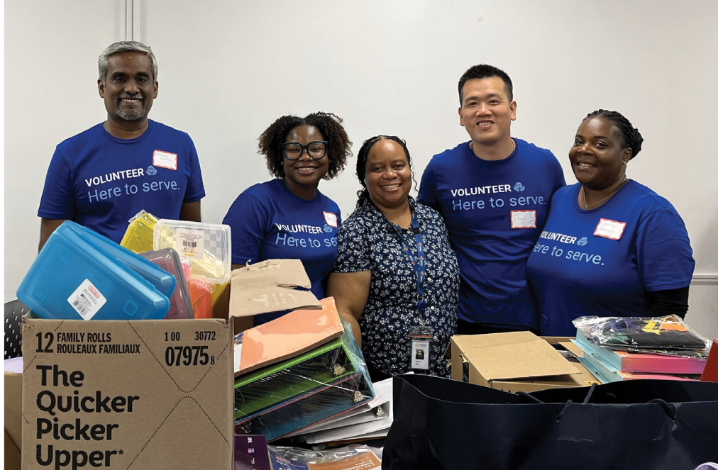
Volunteers from United Nations Federal Credit Union packing backpacks with school supplies.