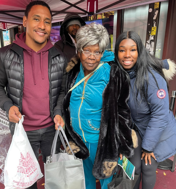
The Yard - East Flatbush Family Enrichment Center Thanksgiving turkey and food giveaway.