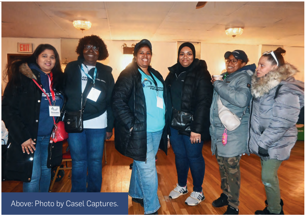
Above: Photo by Casel Captures.